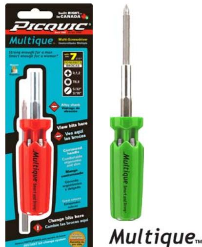
Item # 1905102