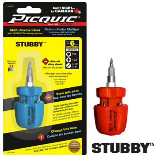
Item # 1991100