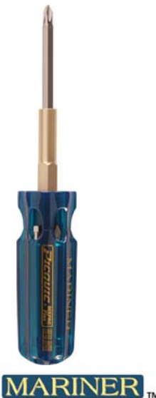
Item # 1988102