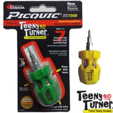
Item # 1906102