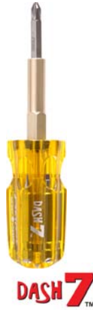
Item # 1908107